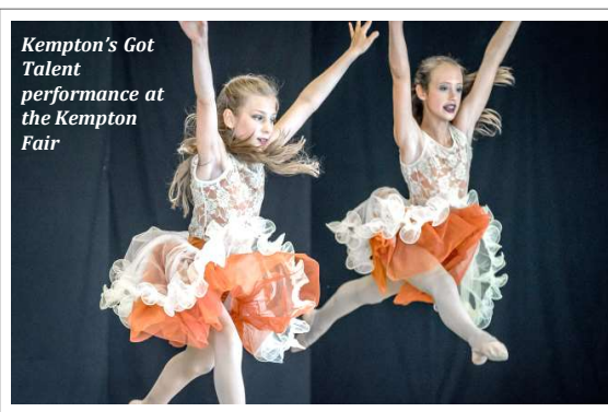
Kempton's Got Talent performance at the Kempton Fair