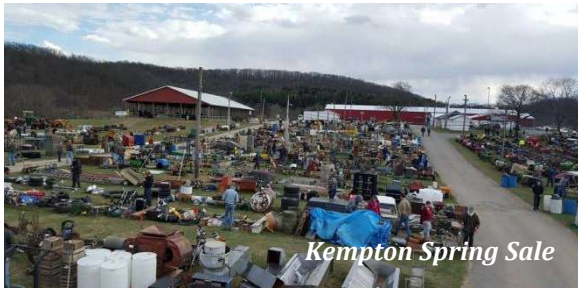
Kempton Spring Sale