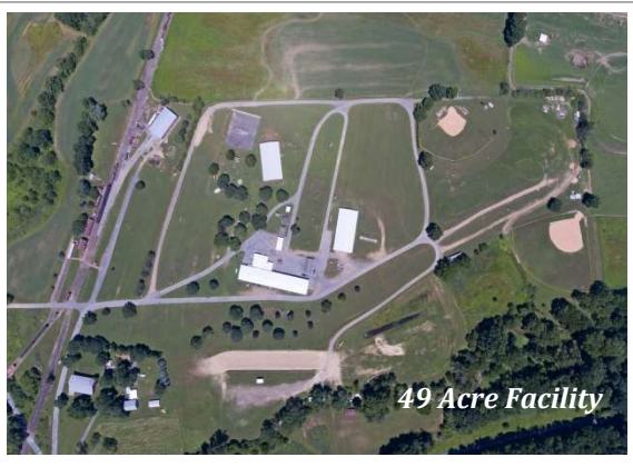
49 Acre Facility